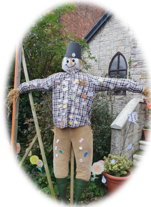
The Remembrance Garden

At our Celebration Sunday Service, the garden came even more to life with the inclusion of the 'Bill Pringle' scarecrow made by the GLOW children. Attendees added their personal touches to Bill, making him patches of thankfulness. After the service, we hosted a session focused on harvest crafts and planting, where community members could get hands-on. With thanks to Bill Atteridge for making a delicious vegetable soup that everyone shared—a perfect end to a day of community.