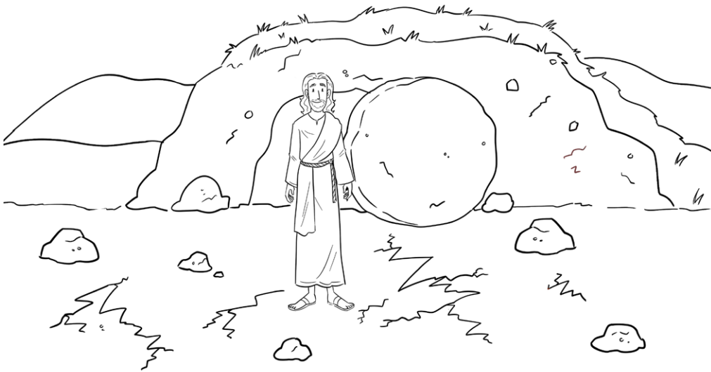
Suddenly, Jesus is back!

Two women visiting the tomb are surprised by an angel and then by Jesus himself.